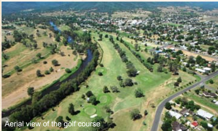
Aerial view of the golf course

Bingara Sporting Club is a Licensed Club with wonderful sporting, entertainment & function facilities. Bowls, Tennis, Squash and Golf. The new restaurant serves Chinese and Australian meals. Visitors are welcome.